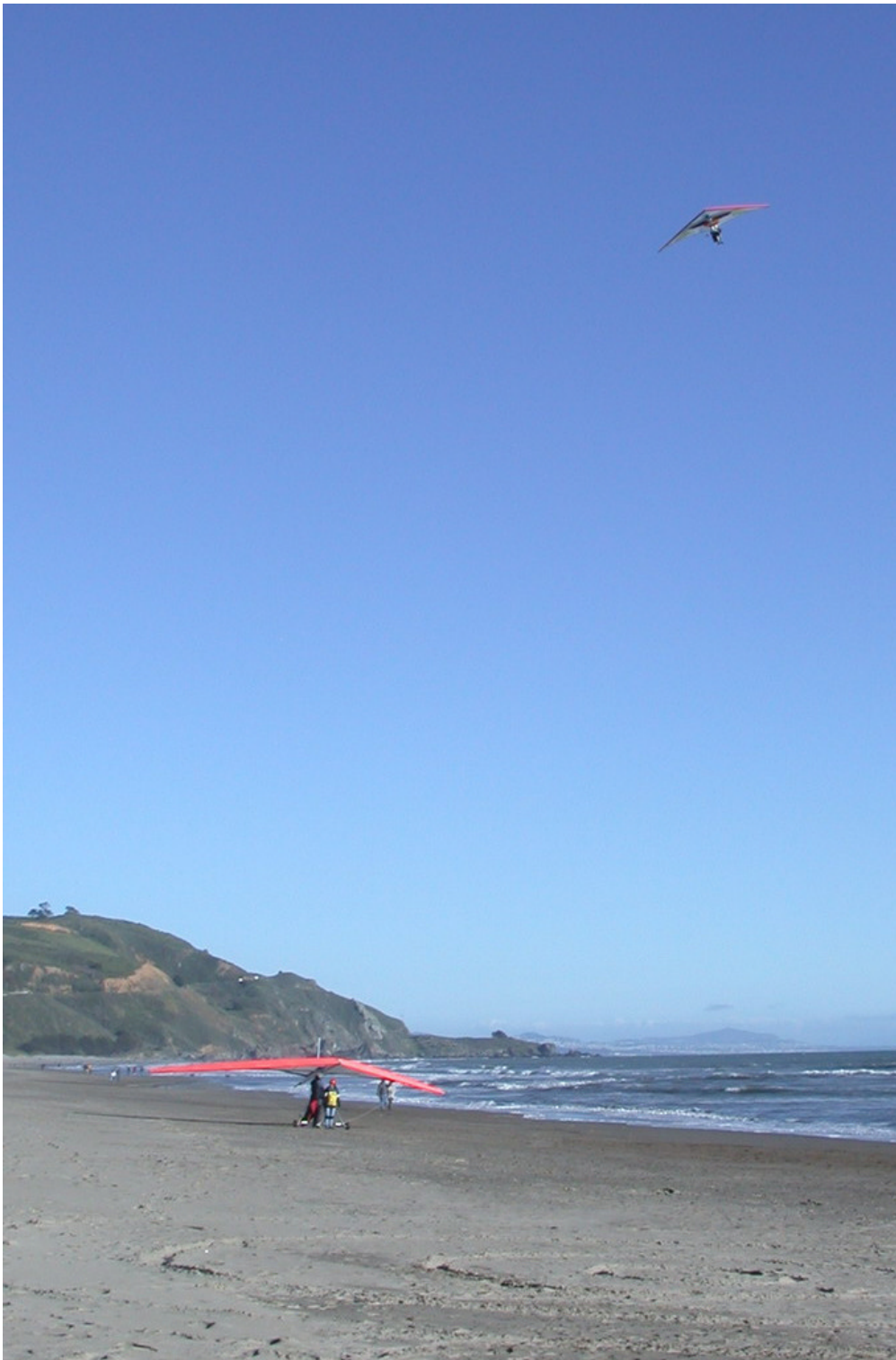
Incoming! A tandem pair trade 'wows', while another glider starts its approach.

Newsletter of the Marin County Hang Gliding Association