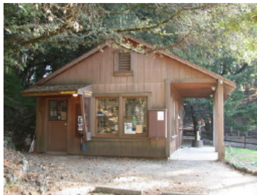
◀ Pan Toll Ranger Station, where pilots sign in for the day to fly Mt. Tam